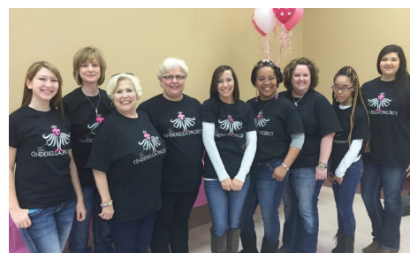
CKB – Tallulah Volunteers

All dresses are then put on display at the Civic Center for selection by all interested area junior and senior high school girls who have their own personal shopper to assist them. This year our Tallulah Branch provided the bank's team of volunteers for the day of the Dress Giveaway. Over 100 dresses were contributed by CKB through the generosity of our customers and friends.