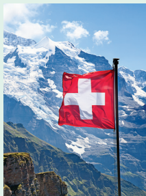
Austria, Switzerland, Bavaria July 2016