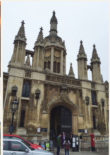
CKB Travel Club members spotted a familiar logo on a pub in Edinburg, Scotland (top left), experienced the mysteries of Stonehenge (bottom left) and enjoyed the unique architecture of this ancient church in York, England (bottom right).