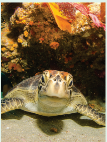
Costa Rica February 2016